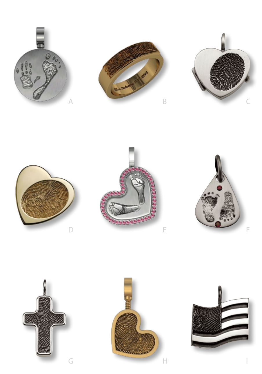
A. Circle Cremation Ash Pendant w/Baby Prints (Page 14); B. Partial Fingerprint Band (Page 10); C. Heart Locket (Page 12); D. Heart Slider (Page 4); E. Heart w/Gemstone Bezel (Page 5); F. Teardrop Charm (Page 6); G. Framed Cross (Page 8); H. Heart Cremation Ash Pendant (Page 15); I. Flag (Page 9).